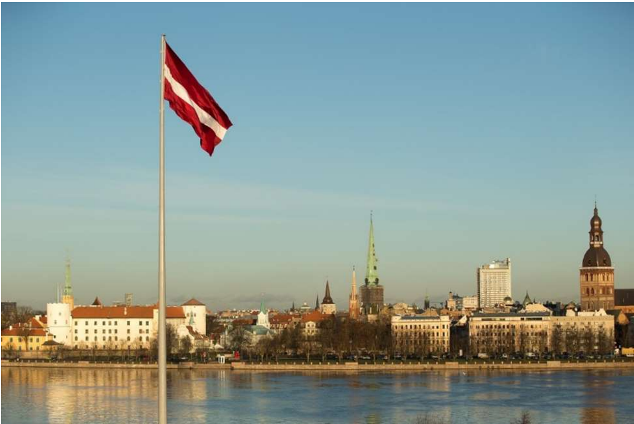
Riga [Rīga]