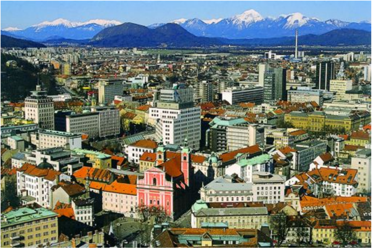
Ljubljana