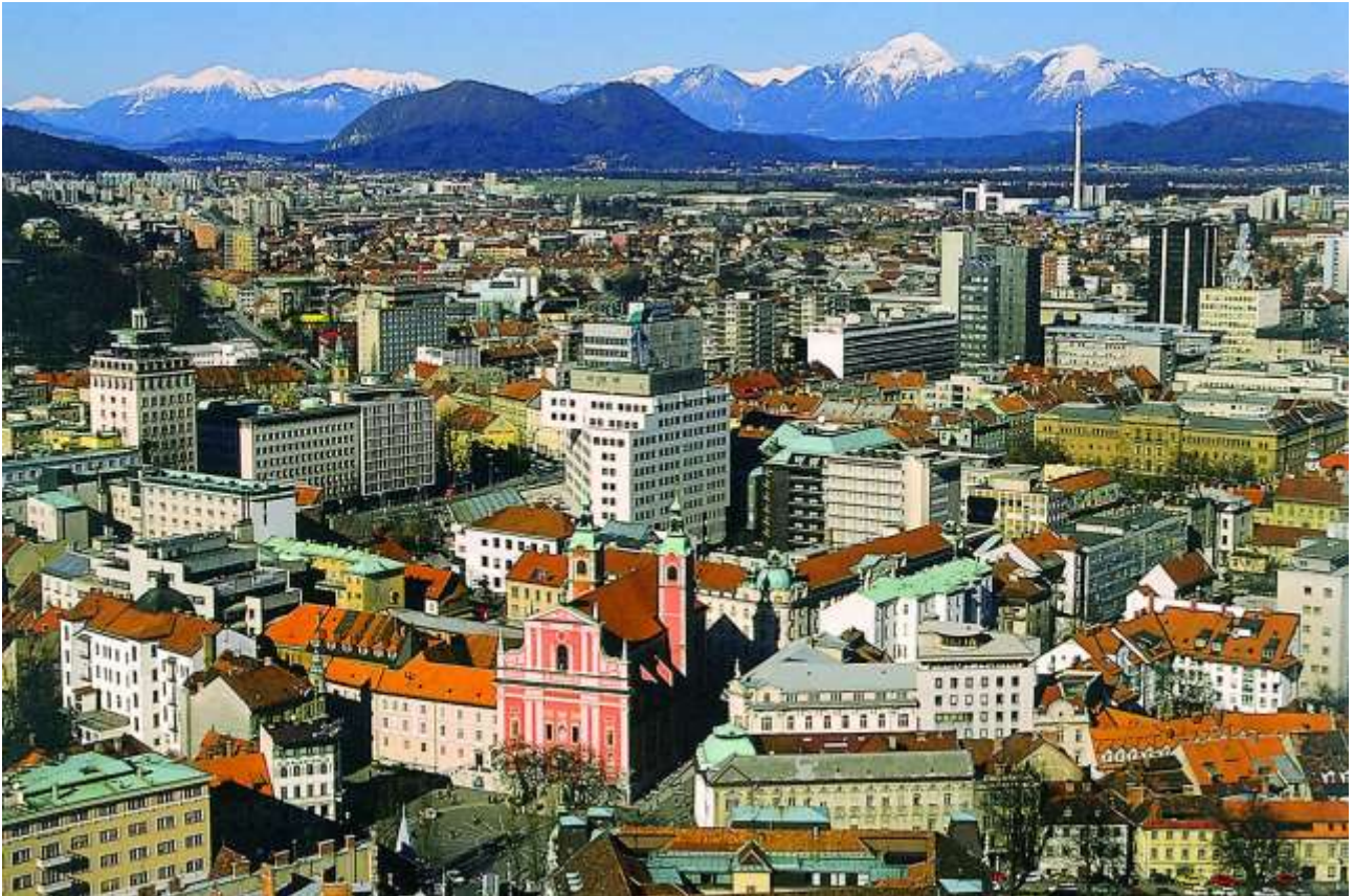
Ljubljana