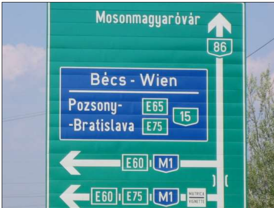
Fig. 4: Hungarian traffic signposts show exonym and endonym