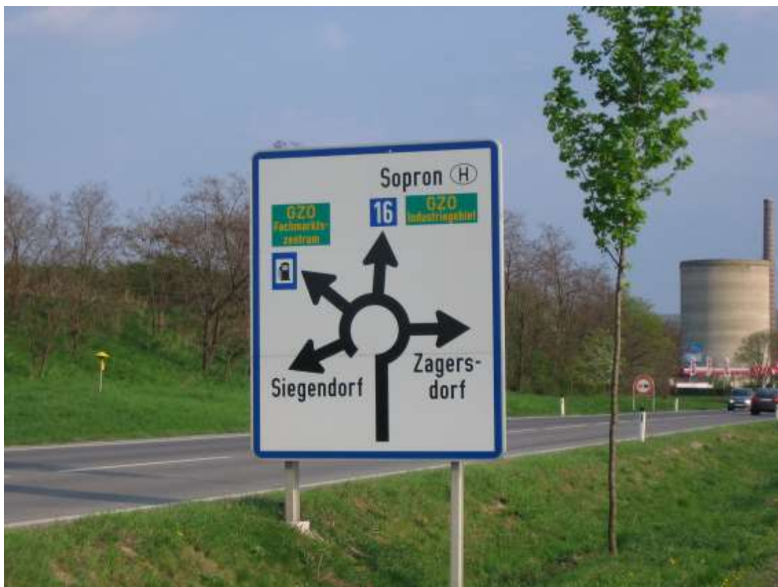
Fig. 2: Even an officially bilingual place in Hungary, Sopron/Ödenburg, is indicated only by its Hungarian name on Austrian traffic signposts