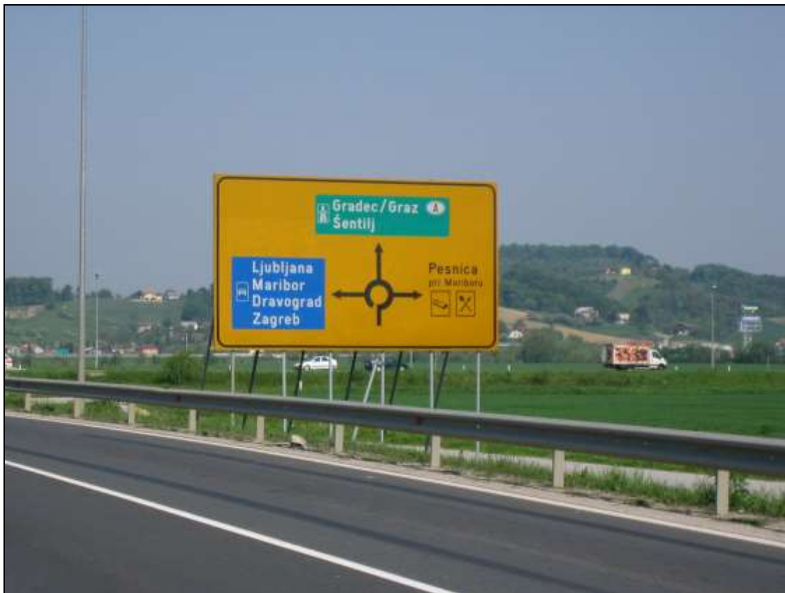
Fig. 5: Slovenian traffic signposts show exonym and endonym

Also in Austrian railway traffic – with station signs, schedules and announcements – only endonyms are used.